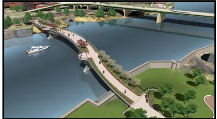
Rendering of planned Mohawk Valley Gateway Bridge

Development parcel directly adjacent to the planned Mohawk Valley Gateway Bridge and recreational area.